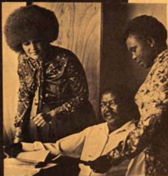
Translation (Sesotho): Stay well, our friend.